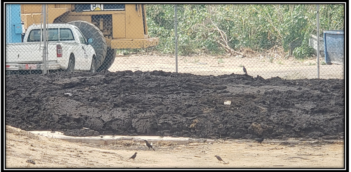
Birds eating from the “sludge” human feces deposits on the terrain at Parkietenbos July 5 th , 2021