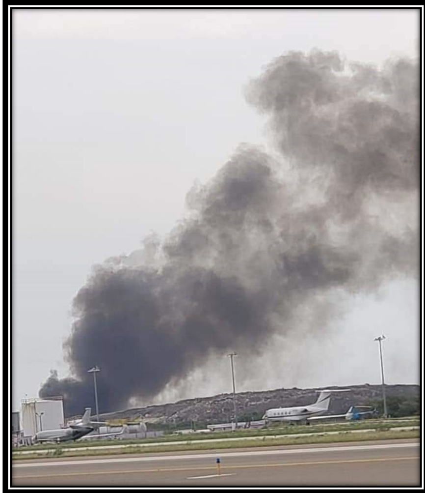
Smoke from the dump next to our international airport Reina Beatrix